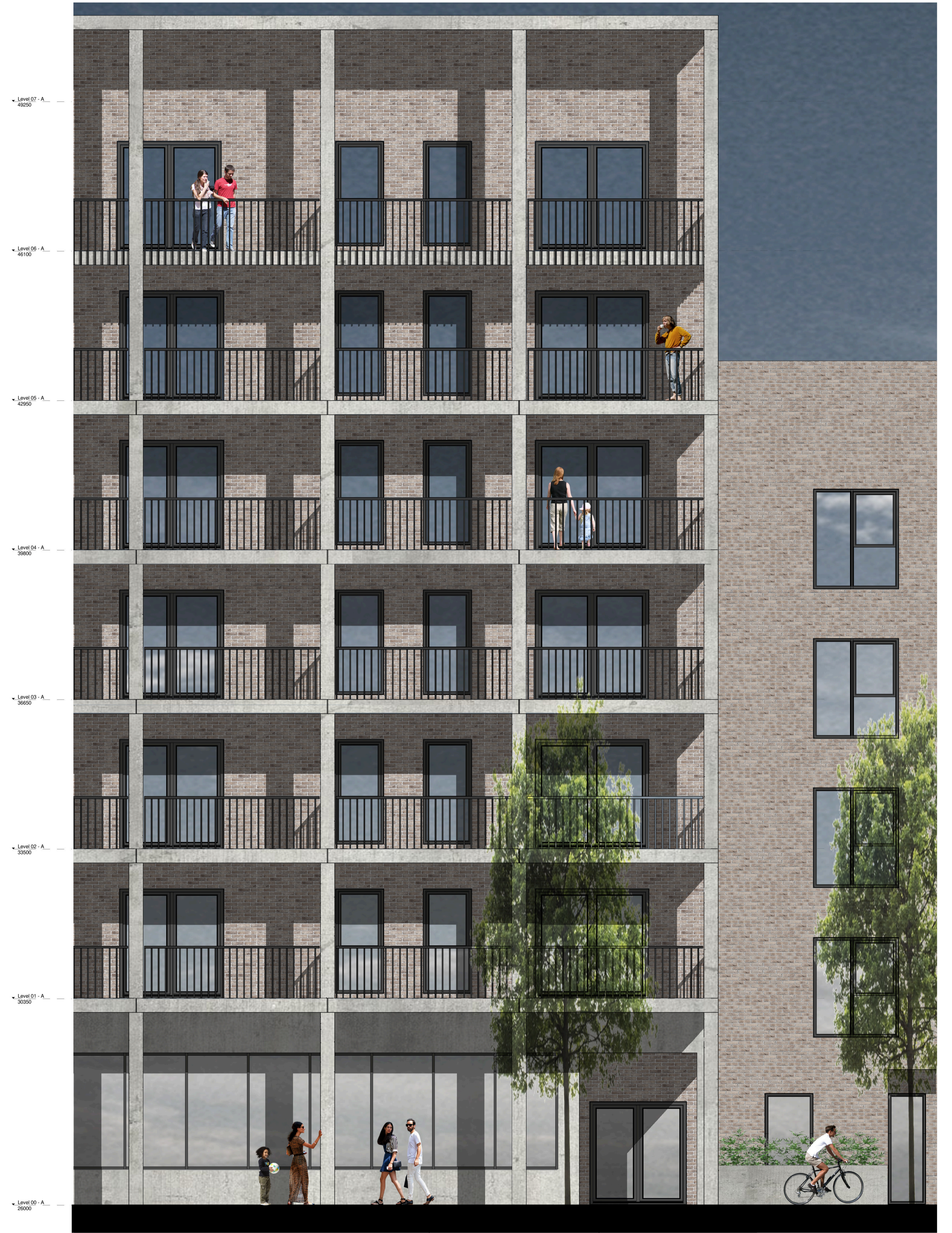
1 Block G Elevation Study 1:50